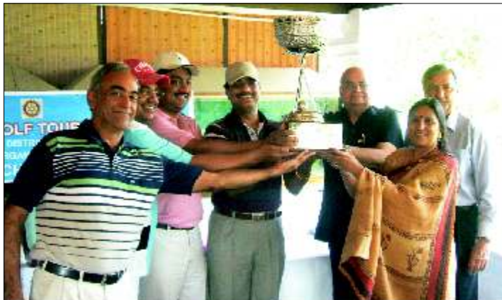
And the winners are .....Team RC Panchkula !