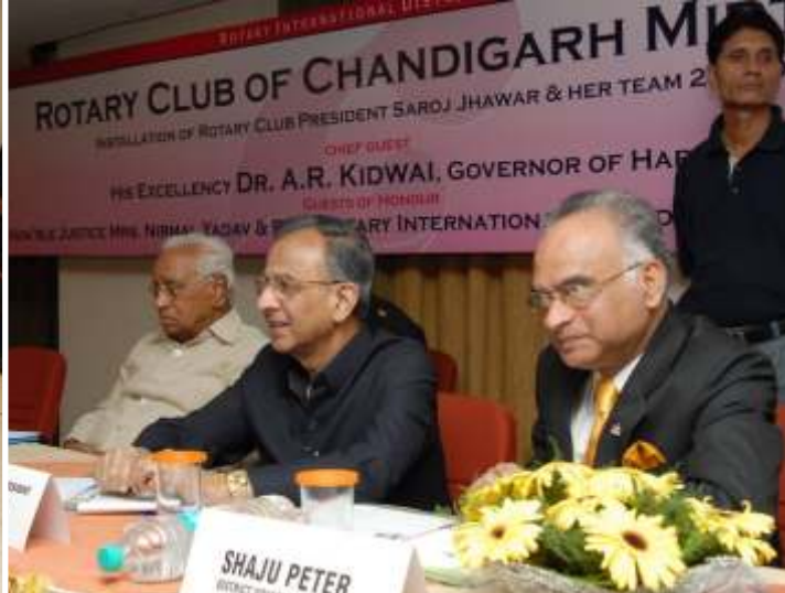
The Captive(ated) Audience