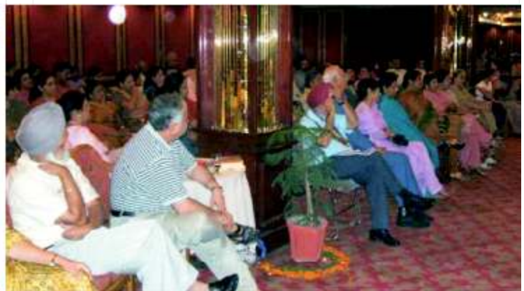
House Full !