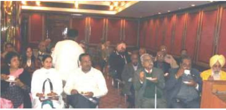
Interactive Session with the Mayor