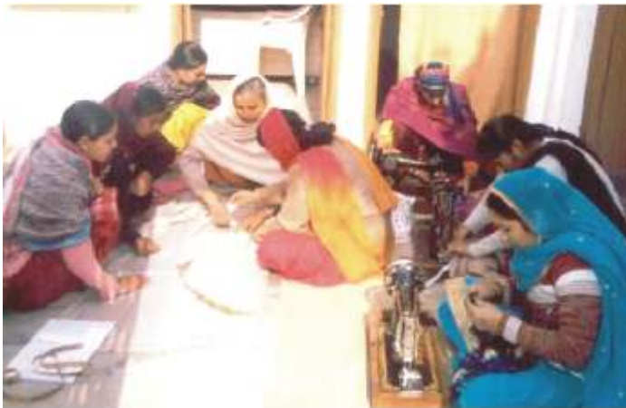
Village ladies being trained in tailoring