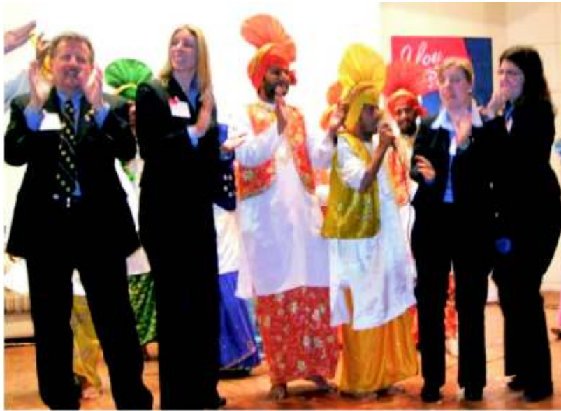
GSE team members in black suits blended well with the bhangra team in their colourful costumes. Truly, a great cultural exchange!