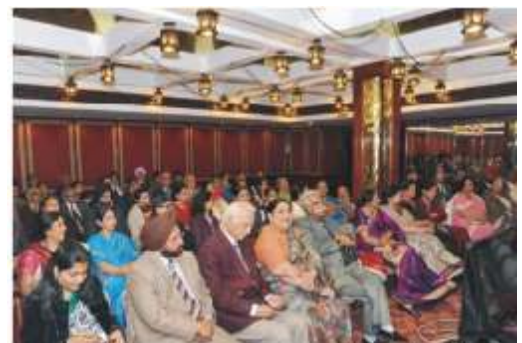
Sheesh Mahal House full!