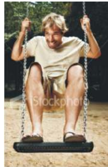
Needs a Push

"Over here on the swing," replied the drunk.