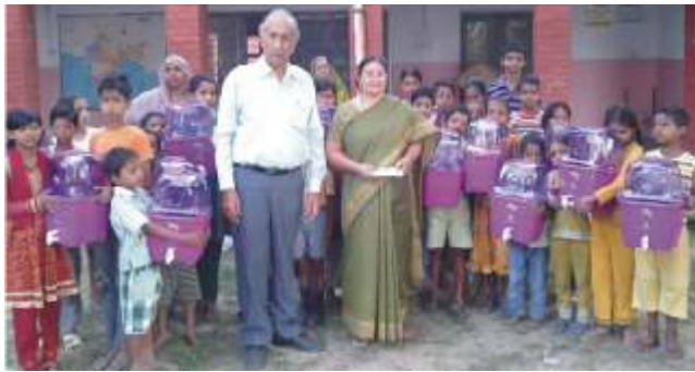
President R.K. Luther distributes Water purifiers to students

Water Purifier distribution function was organized at Sarangpur Night School last week. 20 Tata Swatch purifiers were given to the students of our Night School, who are children of families working in the brick kiln at village Sarangpur.