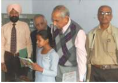
A student reads from donated book

On 17.11.2011 our club completed second of three Library Projects assigned to our club by District 3080 under Rotary Foundation Project DSG-72260 at Govt. High School, Sector 47, Chandigarh.