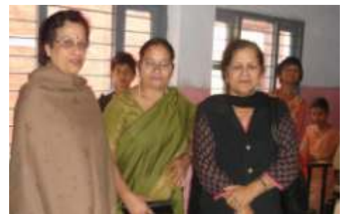
A visit to Night School, Sarangpur

installed in the school by our club in 2001 is presently under break-down, and needs to be brought into working order. Looking forward to a "good Samaritan".