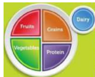
Food Pyramid is substituted with a simpler food plate concept

She had reservations about the fast food and said one should not rely on the processed food. Sonia concluded,