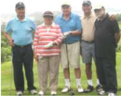
Golf at East London Golf Club