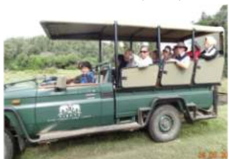
Ride to the forest