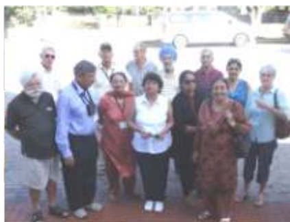
Team members with hosts