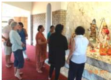
At Hindu Temple