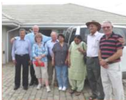
Arrival at East London