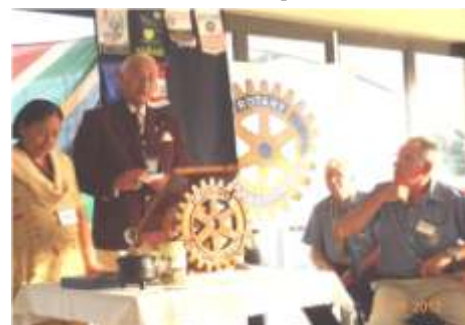
Meeting of Rotary Club of Port Alfred