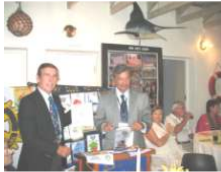
Exchange of flags Kenton-on-Sea Rotary Club