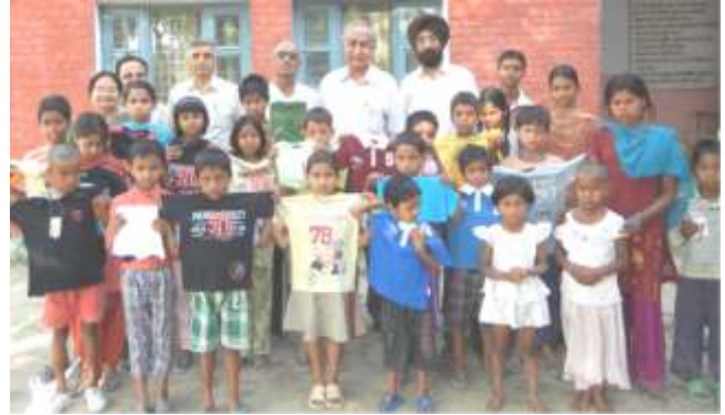
Rotarians with students and their T-Shirts