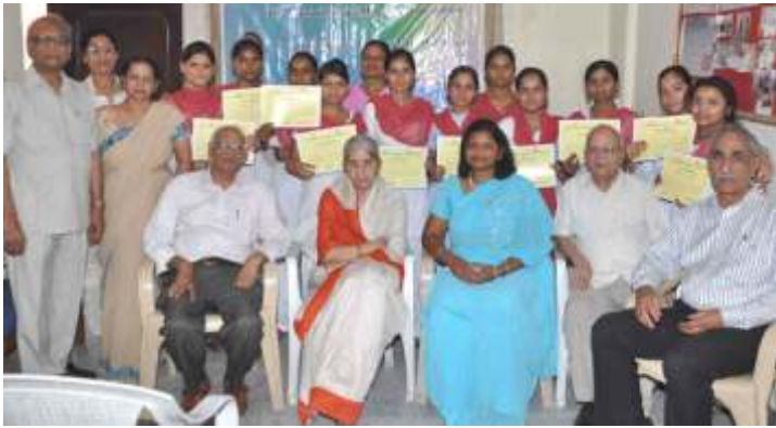
Nursing students with Rotarians and Inner Wheel members