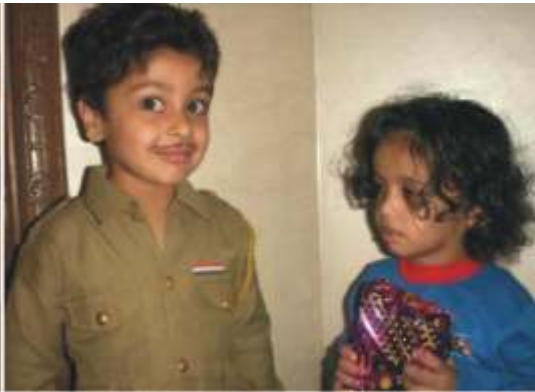
Fancy dress, 'Dabaang – Salman Khan' and the 'Spiderman'