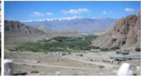
View of Leh from KhardungLa