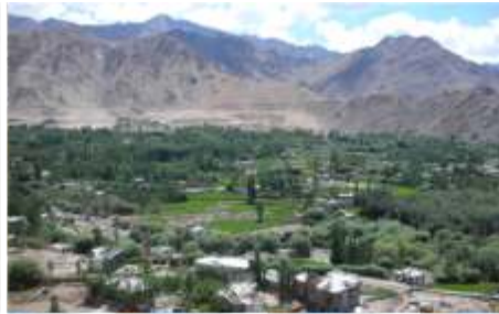
Valley around Leh