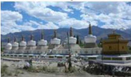
Dalai Lama's Retreat