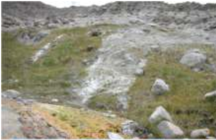
Sulphur Springs, Panamik