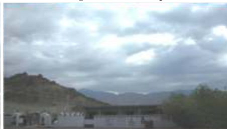
Clouds that don't rain!