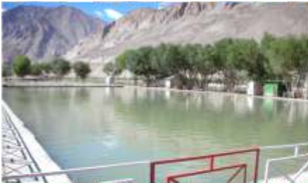
Ice Skating Rink