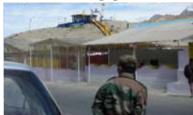
Gurudwara Patthar Sahib