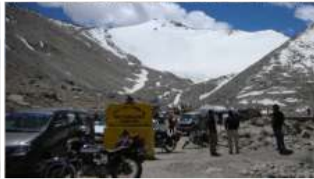
Motor bikes available for sight seeing