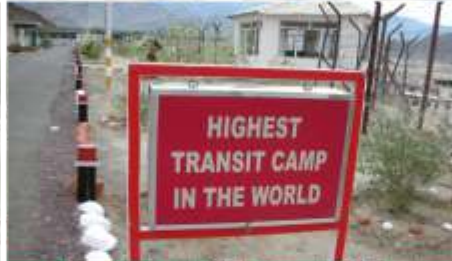
Highest Transit Camp