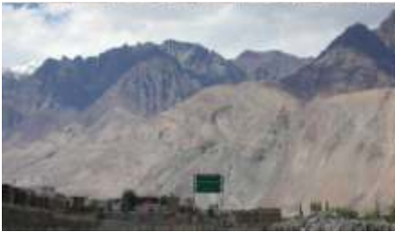
Bare, Bleak and Beautiful