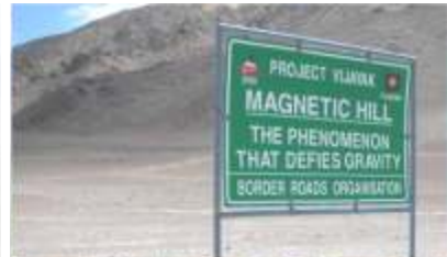
Vehicle goes up hill, with ignition off!