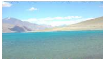
Lake - Changing Colours