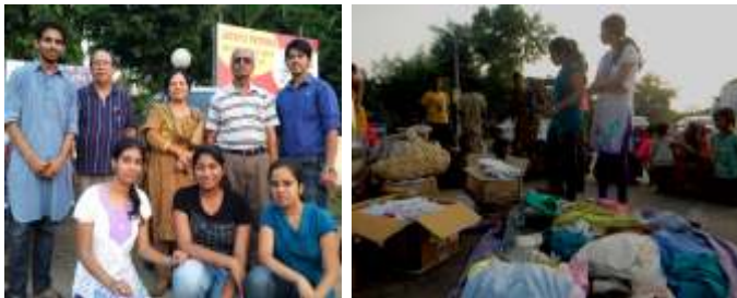
Rotarians and Rotractors distribute clothes to needy persons

Rotary Club Chandigarh Midtown joined Rotract Club Chandigarh Midtown on 15 th September 2012 in Mansa Devi Complex Mandir to distribute about 3000 old clothes, collected from Rotarians of Chandigarh Midtown, to needy and poor men, women and children in vicinity of area.