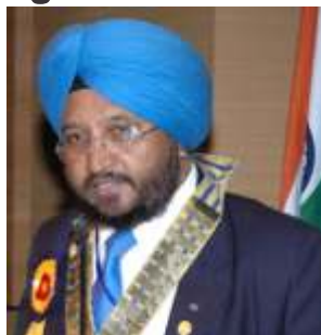
DG Manmohan Singh

ethics and values are being compromised, but public opinion and platform like social media are bringing guilty to justice.