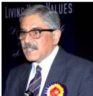
Justice Rajive Bhalla