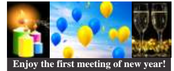
Enjoy the first meeting of new year!