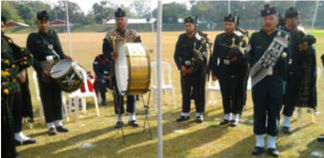
The graceful army band in action