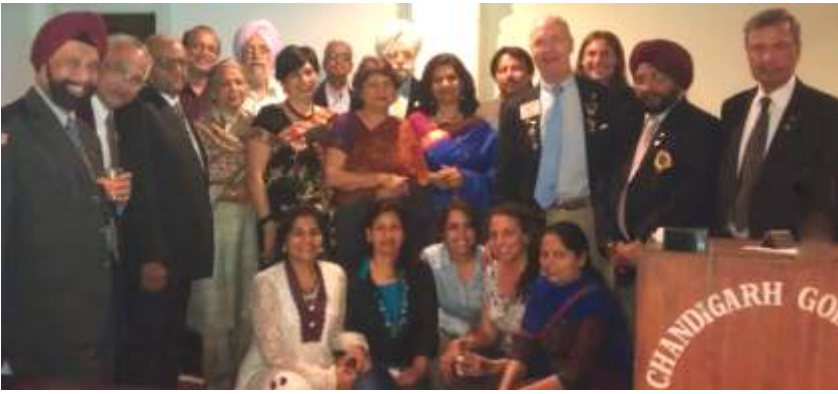
Farewell dinner for GSE Team at Golf Club