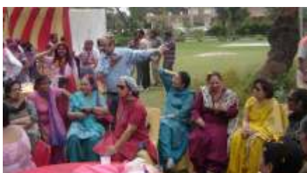
Lady Rotarians and R'anns enjoying the colorful proceedings