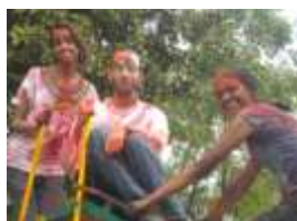
New Generation reach great heights