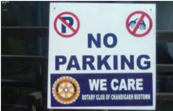
Sign board distributed to all members of our club to tackle parking problem in front of our houses