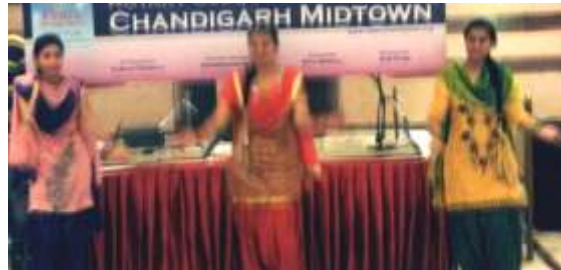
Gidda by Rotaractors