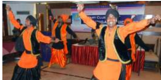
Rotaractors doing Bhangra