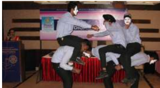
An impressive skit, a mono-acting by Rotaractors spreading social awareness on use of mobile phones