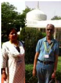
Enjoying their stay at the Ashram

We visited Gurumaa Ashram at Ganaur, near Sonepat from 8 th April to 11 th April 2013 and stayed there in the Ashram. This is unique programme every year for Gurumaa Janam Divas and Sanyas Divas. Enthusiasts of all ages, including children from all over India were there during this period. All of us stayed there in perfect discipline, starting the day at 5.30 am with Aarti with Guru maa, Yoga, Meditation session and Satsang and open Darshan after breakfast and Yog Nidra after lunch at 3 pm. Again we had Meditation and evening Aarti and dinner at 7.30 pm. We had early sleep at 8.30 pm. This schedule remained for all four days. We could do any sewa in Ashram, starting from kitchen, serving food, cleanliness or any other service. We remained busy the whole day in very peaceful atmosphere. Mobiles were not allowed in the premises, and we were free from all worldly activities and enjoyed keeping silence. Janam Divas was celebrated on 8 th April with great enthusiasm by all of us with Guru Pooja and dancing with best Gurumaa Bhajans. Four wonderful days ended with Sanyas Divas on 11 th April 2013, with Gurumaa live programme along with her Ananda Ghosh Band.