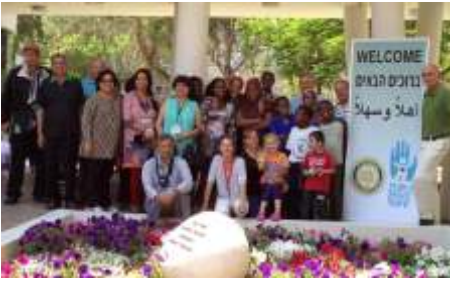
Team outside Care Home for Children in Israel