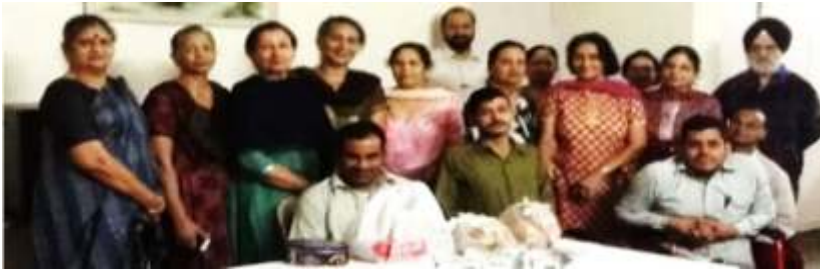
Rotarians and Inner Wheel members of Chandigarh Midtown and members of Cheshire Homes celebrate Diwali with disabled inmates of Cheshire Homes, Chandigarh