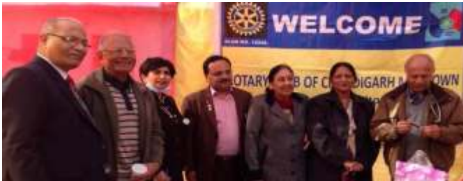
Medical camp at village Faida