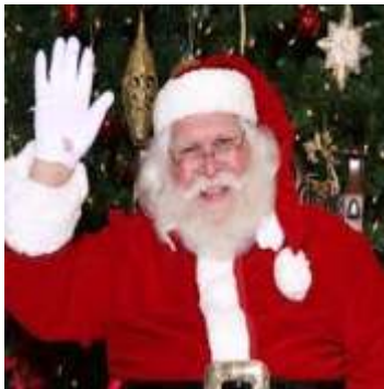
Was the Chief Guest Santa Clause present in the meeting?