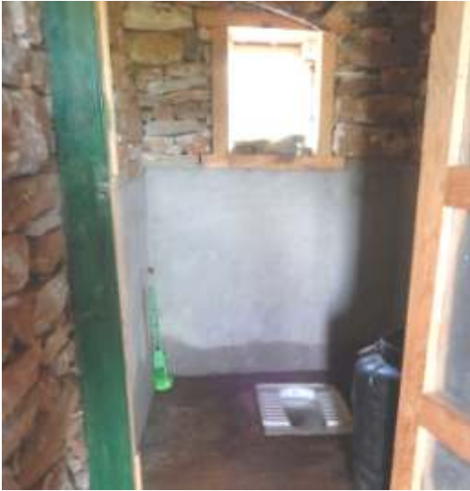
Bio gas toilet