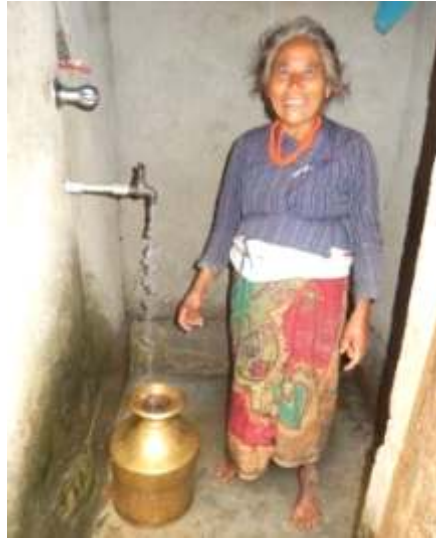
Clean water supply