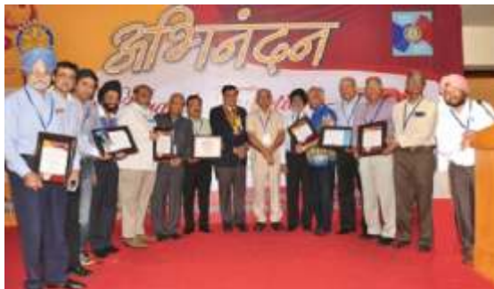
Rotarians of Chandigarh Midtown holding the awards bagged by our club

In the Rotary Award Function for District 3080 held on June 29, 2014 at Hotel Hometel, Chandigarh, our Club has won 18 Awards as follows;