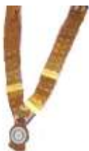
Presidential Collar of Rotary Chandigarh Midtown

Hon'ble Member of Parliament, Rajya Sabha