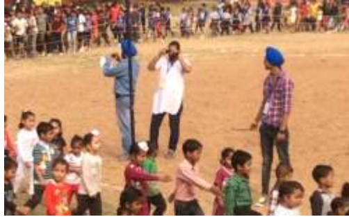
March past by students participating in the sports meet at Khuda Ali Sher