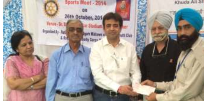
Presenting Cheque for Rs. 15000/- in favour of Youth Club

On 26 th October 2014 our club in association with Rotary Community Corps (RCC), Khuda Ali Sher and Youth Club, Khuda Ali Sher organized sports meet at Dr. B.R. Ambedkar Stadium in Khuda Ali Sher. 300 Students from seven different schools participated in various athletic events, which started at 9.00 a.m. after the inauguration ceremony in which the children did march past. Children from the age of 7 to 17 participated with full zeal and enthusiasm. Kabadi matches were also conducted between 10 teams.