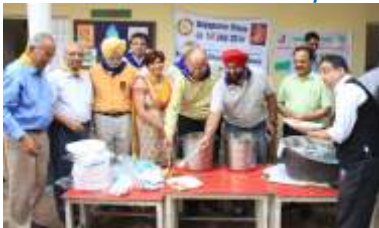
Langar being served by President, Past Presidents and other Rotarians of Chandigarh Midtown