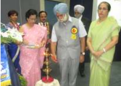
Lighting up Rotary