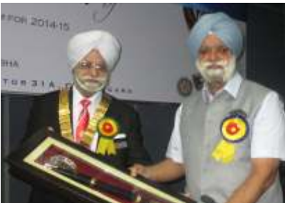
Memento to Chief Guest