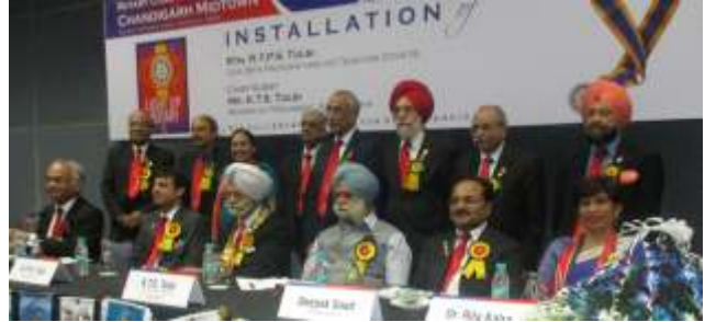
Board of Directors 2014-15