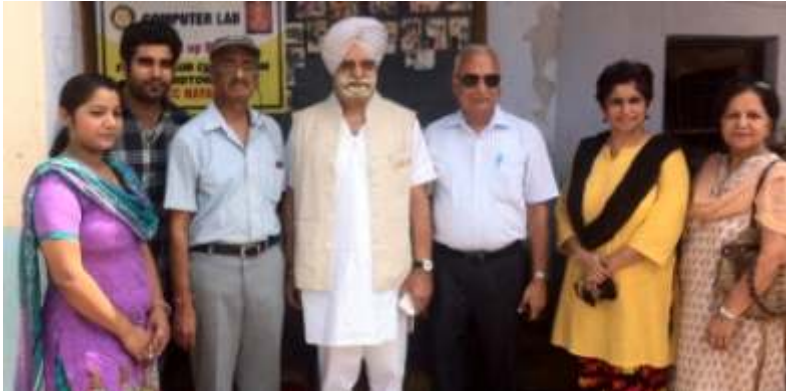
Adult Women Education Centre and Computer Training of children, Nayagaon