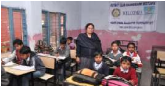
Night School, Sarangpur

Rotary Chandigarh Midtown stands fully committed 'Towards Total Literacy' program, and we have taken up various projects in this regard in and around Chandigarh.