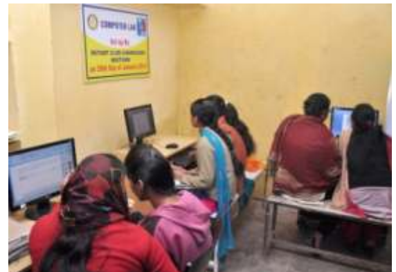
Computer Training Centre for girls, Khuda Ali Sher