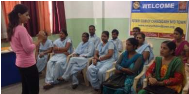
Adult Women Education Centre, Kundan School, Sector 46, Chandigarh