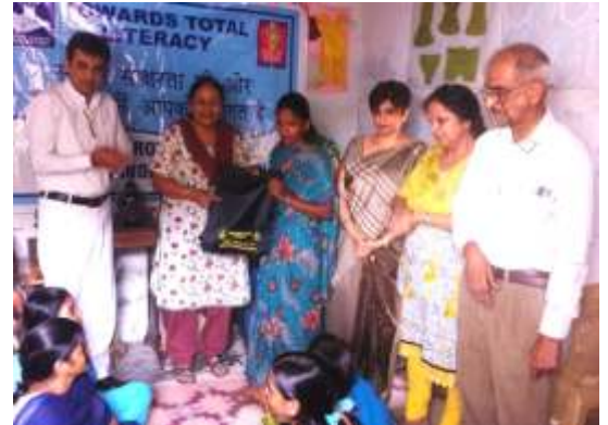
Adult Women Education centre and Sewing & Tailoring centre, Faida