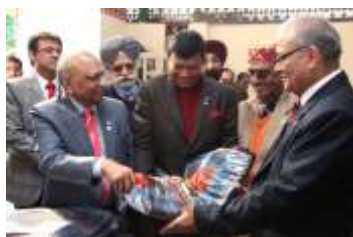
Blankets donated at Aasra Shelter