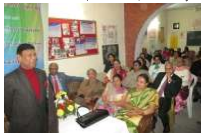
DG addresses gathering at Homecare Nursing and presents 1st aid kits to students