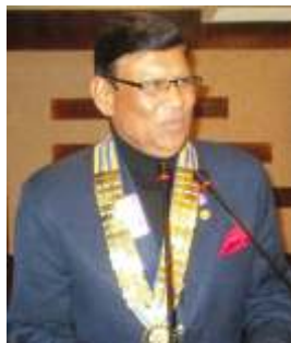
An inspiring address by DG Col. Patnaik