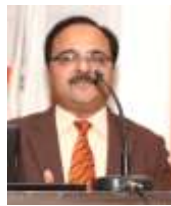
Welcome address by IPP Deepak Sood