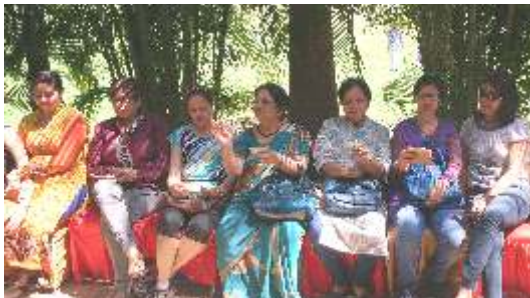
Ladies playing tambola