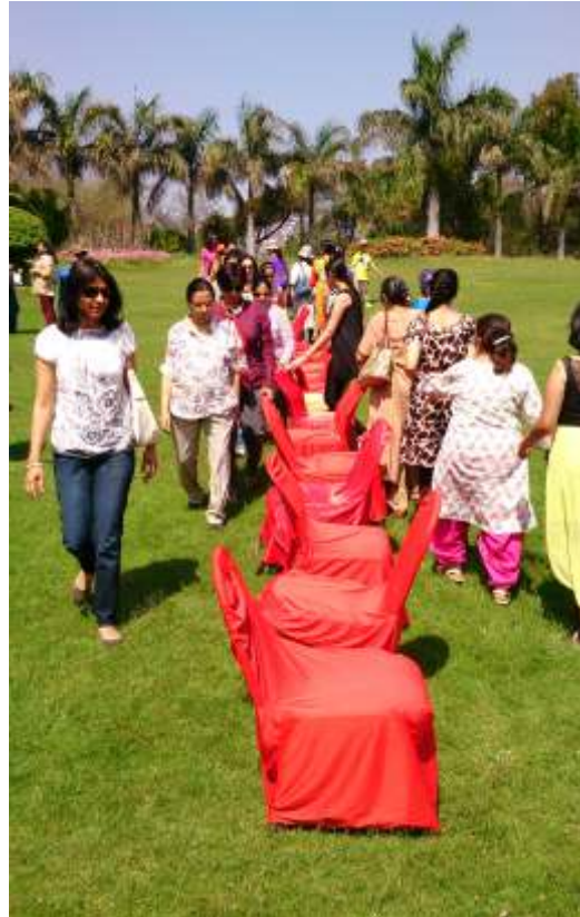
Musical Chair for ladies