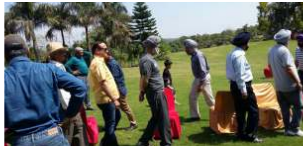
Musical chairs for gents