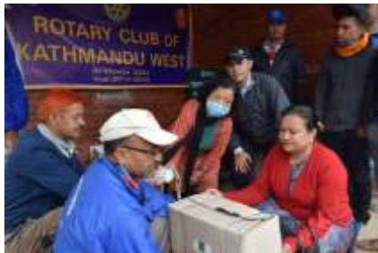
Rescue missions in Nepal

Rescue missions and emergency aid continue to arrive in Nepal after a massive earthquake hit the country on 25 th April 2015, killing thousands of people and injuring thousands more. The 7.8 magnitude quake, the worst to hit Nepal in more than 80 years, has affected 8 million people in the country's 39 districts, including 1.4 million needing food assistance, according to Government officials.