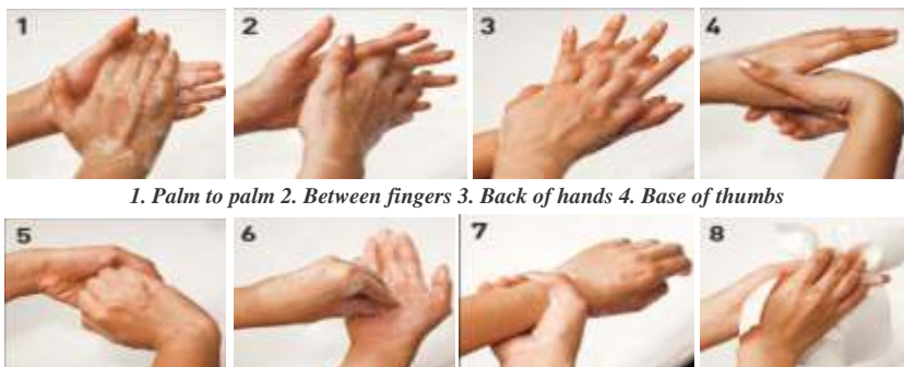
1. Palm to palm 2. Between fingers 3. Back of hands 4. Base of thumbs

She remarked, "Just chill...! Keep food at safe temperatures. Do