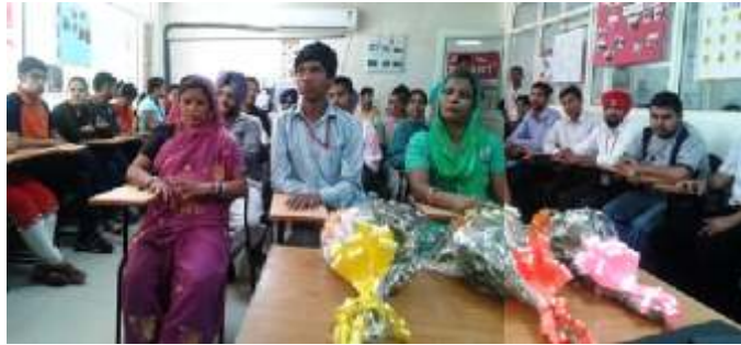
Smart, disciplined and intelligent special children with their parents