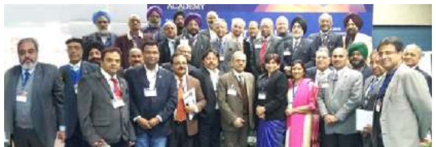
The participants and organizers of the training programme