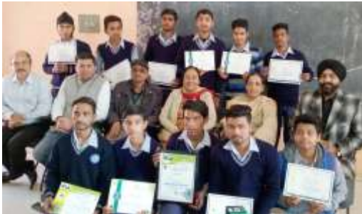
Rotarians with members of Interact Club GSSS Mani Majra