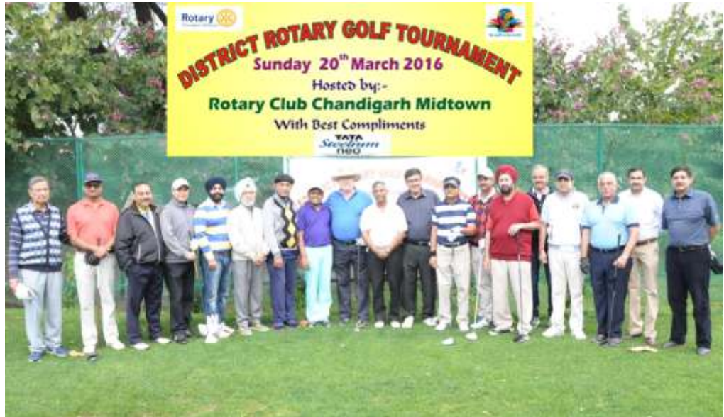
District Golf Tournament hosted by our club at Golf Club, Chandigarh on Sunday, March 20, 2016. Please see report in our next bulletin