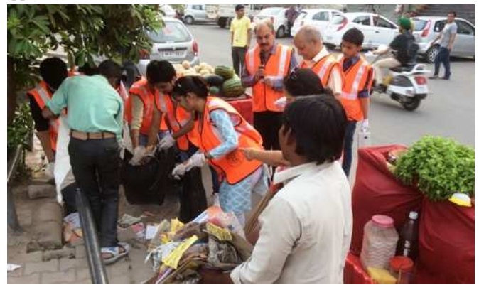
Swachh drive in Sector 20 market, Panchkula with participation of MC

maintain cleanliness. The Mayor accepted our request for 2 officials from Municipal Corporation who would accompany us during our routine visits and their presence would mean official support from the Municipal Corporation. They may even be empowered to impose penalty to defaulters. This would result in the much needed positive approach towards the swachh movement.