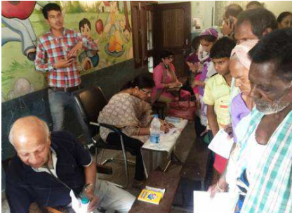
Patients receive free medicine