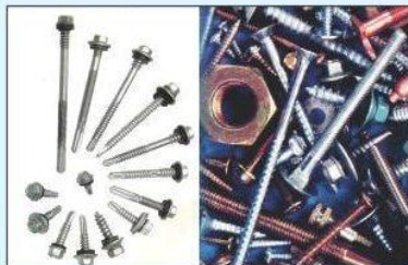
Self Drilling/Tapping Screws & Special Purpose Fasteners

C-45, Phase-III, Industrial Area, Mohali, Distt. Mohali (Punjab) India 160055 E-mail: atulfasteners@airtelmail.in Phone: (O) 0172-4520000, 2221042, Fax: 0172-2271335, Mobile: 98149 29297